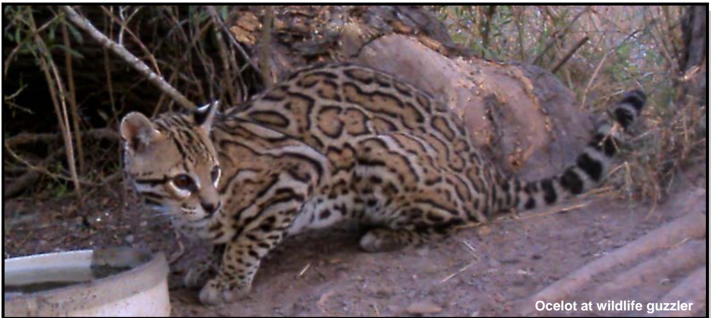
Ocelot at wildlife guzzler

Your adoption makes a difference for ocelots!