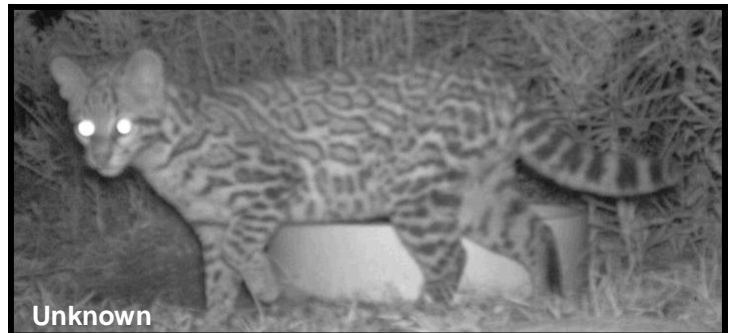
Esperanza's litter of two, August 2009.

S alma and her mother are two currently known female ocelots on the Refuge. She has been photographed with her mother several times and is playful, feisty and full of energy. She was captured in December 2010 but was too small to radio collar. She is a calm, alert, and independent young female who no longer travels with her mother but is still in her parents' territory. Salma is one of the future breeding females and there is a lot of hope riding on her success.